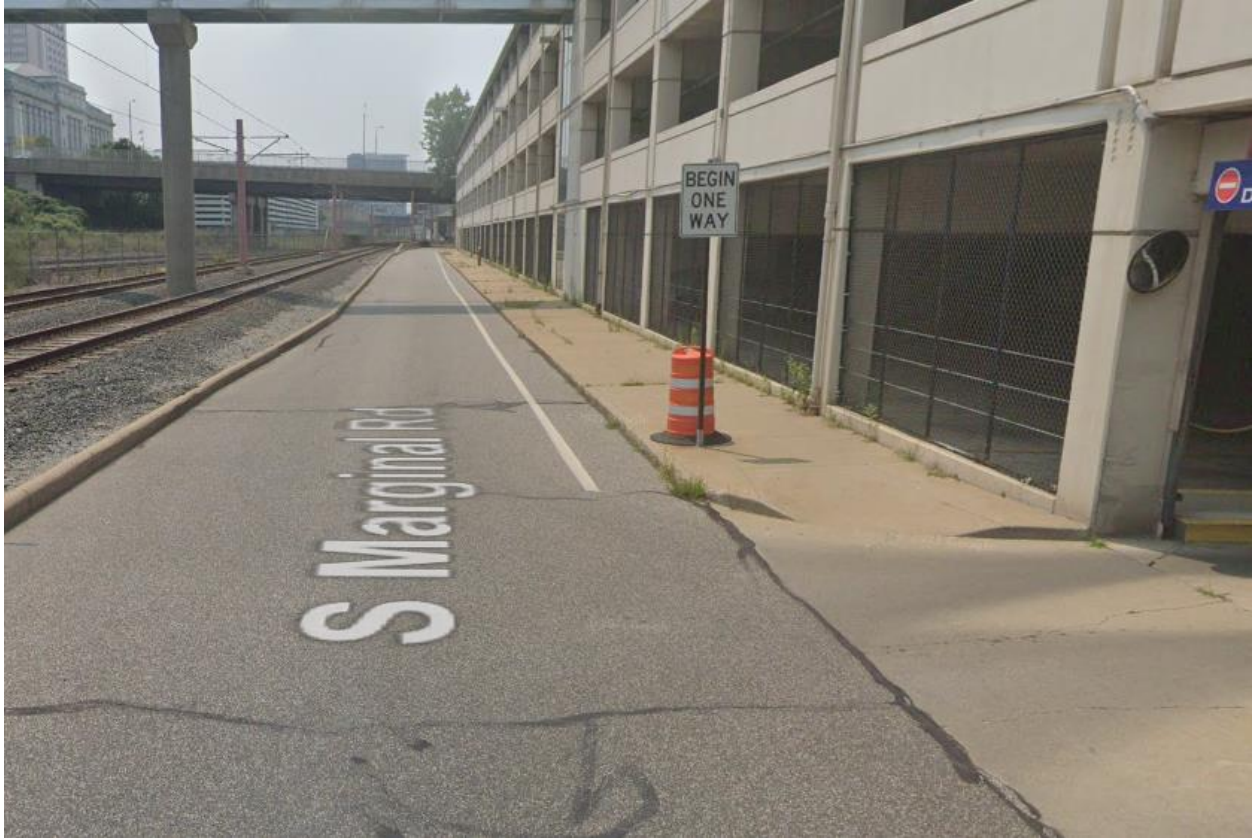
Behind the North Parking Garage S. Marginal becomes One-Way street west, You will go under the East 9 th St Bridge.....it looks scary but nicer on the other side.