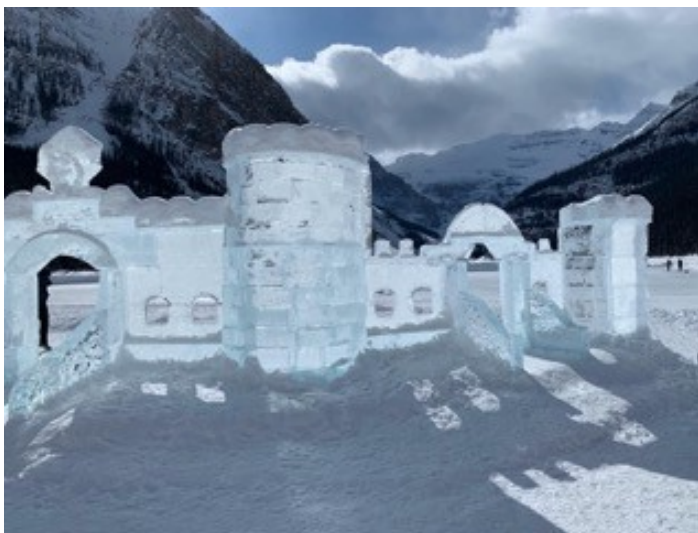
Ice Sculpture at Lake Louise

Lake Louise, one of the largest ski resorts in North America, is vast. It presented magnificent, never-ending views, and countless chair lifts to all sorts of