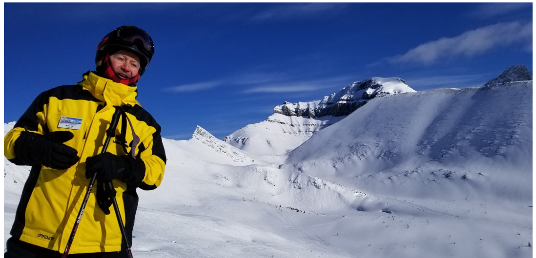
Mountain guide describing the back bowls of Lake Louise