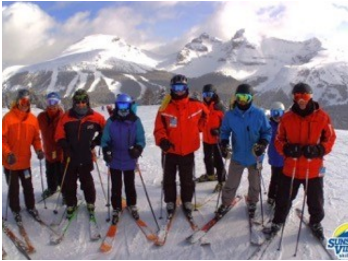
Chagrin Valley Ski Club takes to the slopes at Sunshine Village

day, March 7 th . A comfortable bus ride of less than two hours brought us to the Ptarmigan Hotel in Banff. There we were treated to a welcome reception of pizza, veggies, dips and drinks, and an overload of information about BANFF SkiBig3: Lake Louise, Banff Sunshine, and Mt. Norquay.