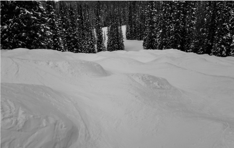
Gnarly moguls at Lake Louise

disturbing news all week about the spread of coronavirus, and airport TVs were a constant reminder about the risks of travel.