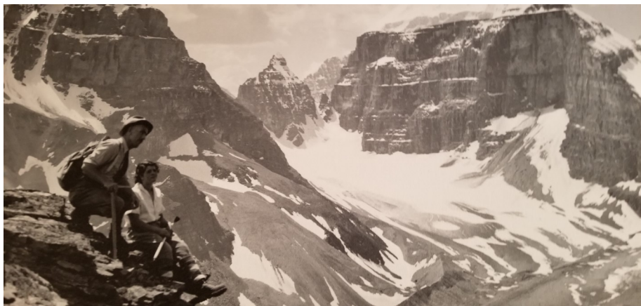
Old photo of Banff area mountains. Switzerland times 50

The weather was frigid most of the week we were there: well below freezing, often in the teens, and