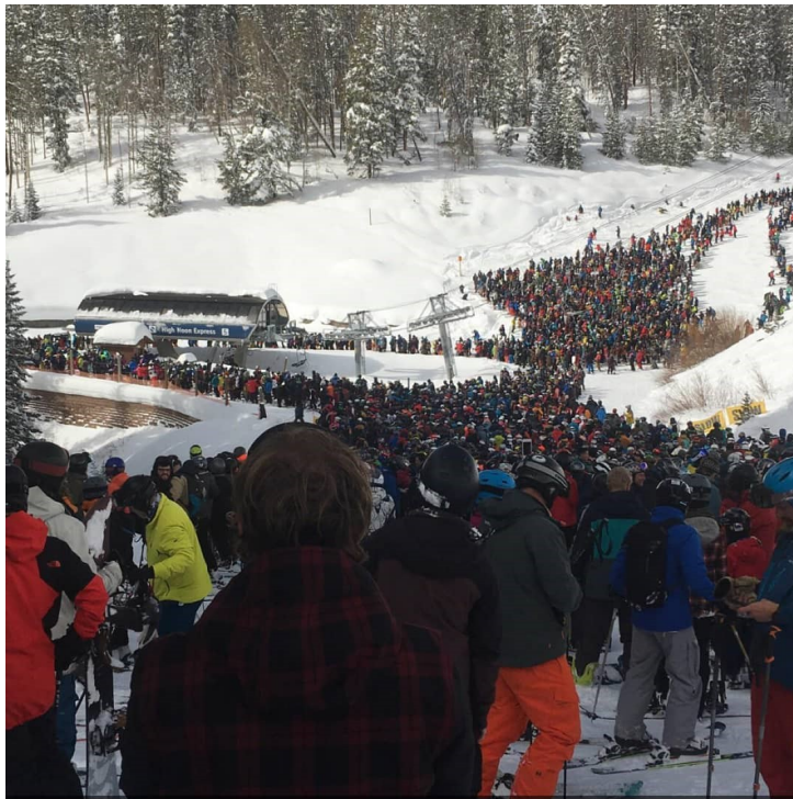
Lift line apocalypse