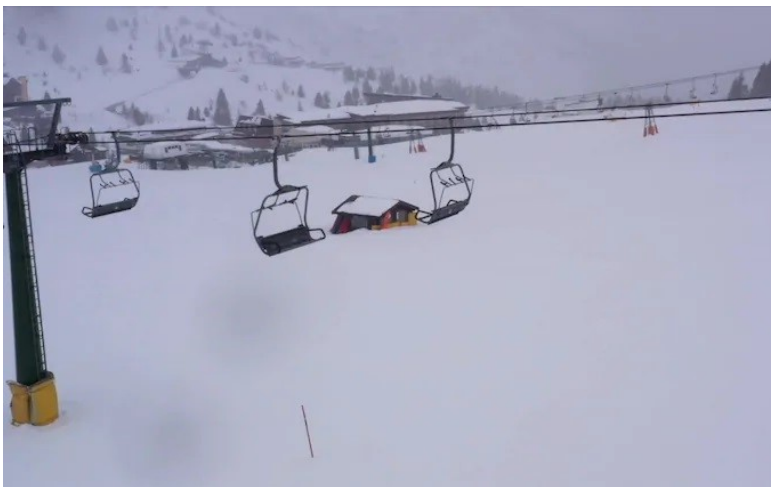
A surprising twist- Empty slopes at Passo del Tonale in Italy due to cases of Coronavirus in Northern Italy.