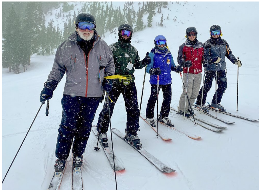
Some of our Taos crew

All was redeemed on Monday, MLK Day. We had 6" of fresh powder. What a great holiday day for the school kids. The snow was so good I went out to Brandywine in the evening and did some teaching. It was wonderful to ski on something other than